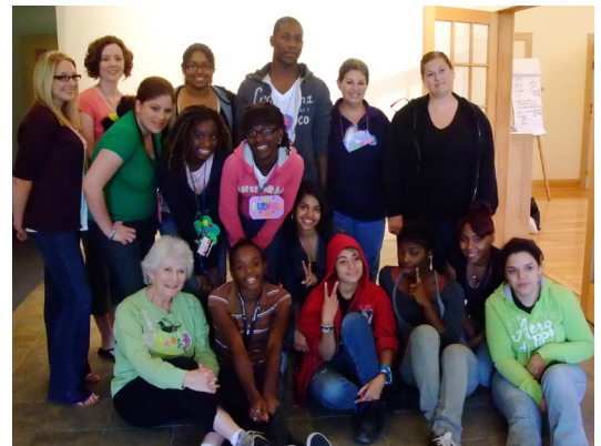
Restore Monroe Youth Leadership Camp